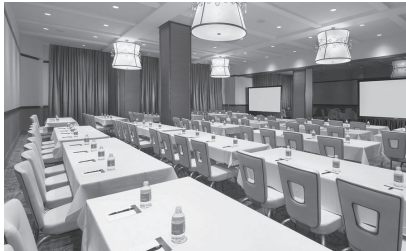
Pictured above and at right: del Lago's conference rooms; bottom: connecting hallways in conference area.