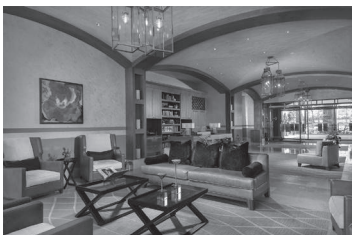
Pictured left: Two views of del Lago's lobby; bottom: entrance to hotel's spa.

All 205 rooms feature thoughtful touches like bathrobes and slippers, along with conveniences such as refrigerators and coffee makers. Free WiFi and 24-hour room service are standard, as are flat-screen TVs with satellite channels.